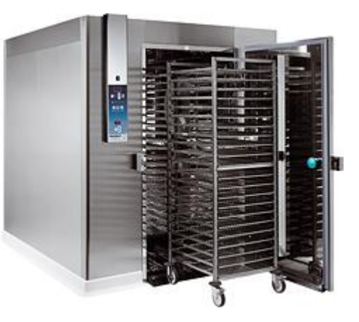
Bottle Overturn Sterilizer